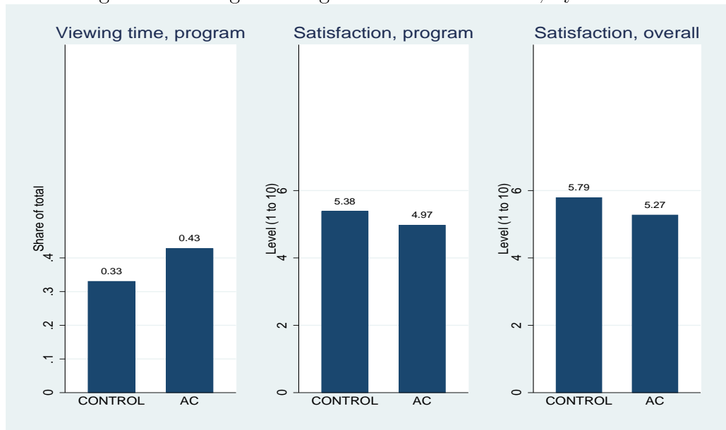
Figure 1: Average viewing time and satisfaction, by content

Table 1 reports average differences across content experimental conditions and significance levels for the corresponding hypotheses, based on GLM and Wilcoxon rank-sum tests. Viewing time for program B, as a share of total, is 42 per cent in the presence of arousing contents, as opposed to 33 per cent in the control condition. The difference is statistically significant (p<0.021) and quantitatively relevant: viewing time for program B rises by about a third in the presence of arousing contents.